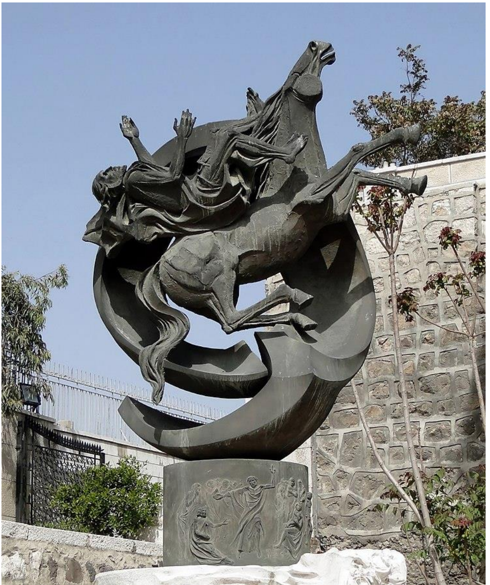
Statue of Saint Paul at Bab Kisan, Damascus, Syria. Statue of Paul as he was struck down by the light, on the road to Damascus (Acts 9:3). The beginning of the conversion of Paul.