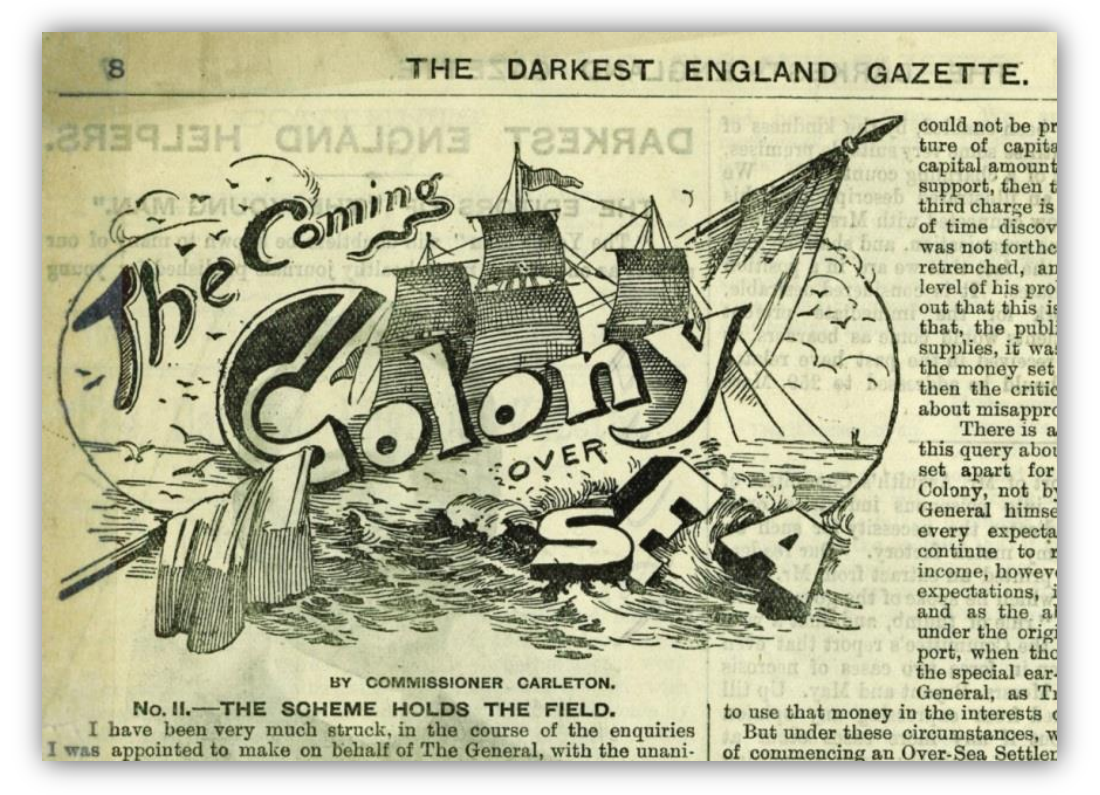
The Darkest England Gazette, 30 December 1893 [PER/5]

Emigration was a fundamental component of the three-stage plan for raising the 'submerged tenth' that William Booth set out in his 1890 book In Darkest England and the Way Out . The 'Over-sea' component of the plan consisted of two elements. The first was the establishment of a governed colony specifically for the submerged tenth who, Booth thought, would be in need of orders, regulations, and close supervision in order to succeed abroad. The second was to create a framework for enabling people from the other nine-tenths of the population to emigrate in an informed and supported fashion, what he called 'universal emigration'.