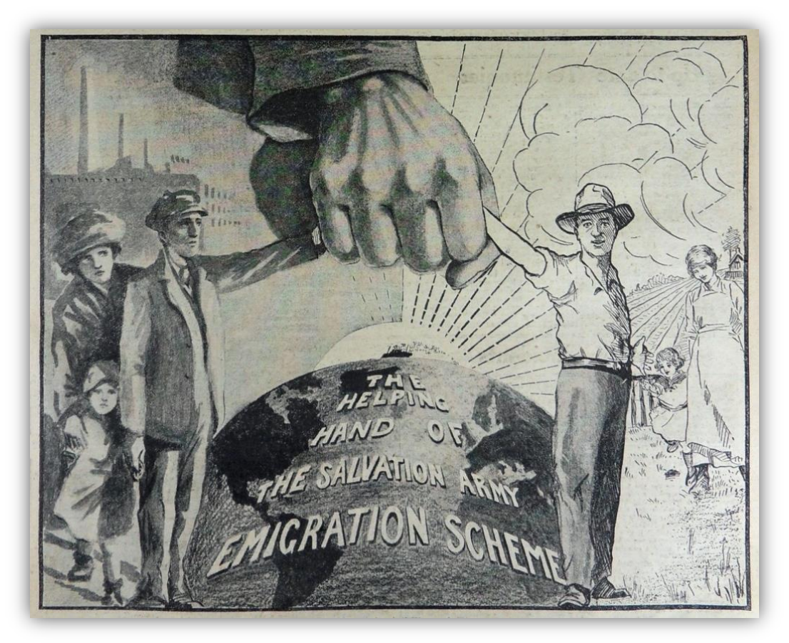
Cover of The War Cry [PER/23], 22 April 1922

The migration of men from Britain was curtailed by the First World War, but in 1916 General Booth's Scheme for Women was inaugurated, primarily to assist widows and orphans to emigrate. The passing of the Empire Settlement Act in 1922 enabled The Salvation Army to establish more schemes for various groups including, most notably, the General's Scheme for Boys. The Salvation Army's Hadleigh Farm Colony was almost entirely given over to training boys on this scheme.