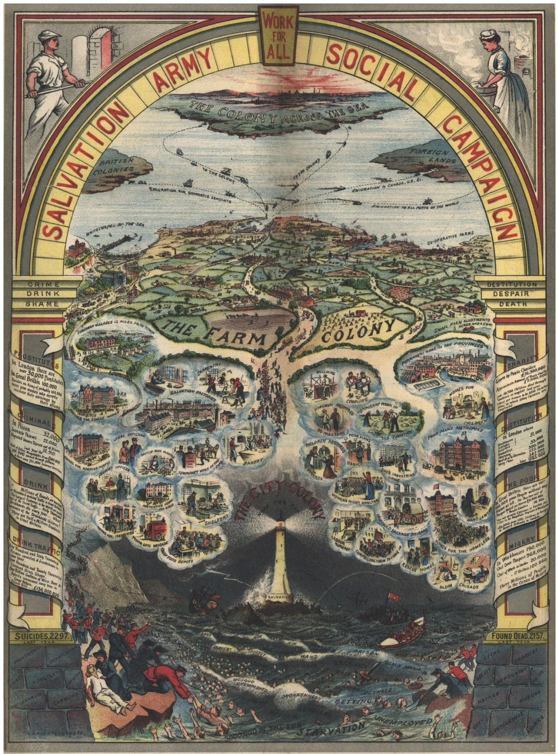
Lithograph from In Darkest England and the Way Out, 1890 [BOO/6]

Fairbank, Jenty, Booth's Boots: Social Service Beginnings in The Salvation Army (International Headquarters of The Salvation Army: London, 1983) [S.41]